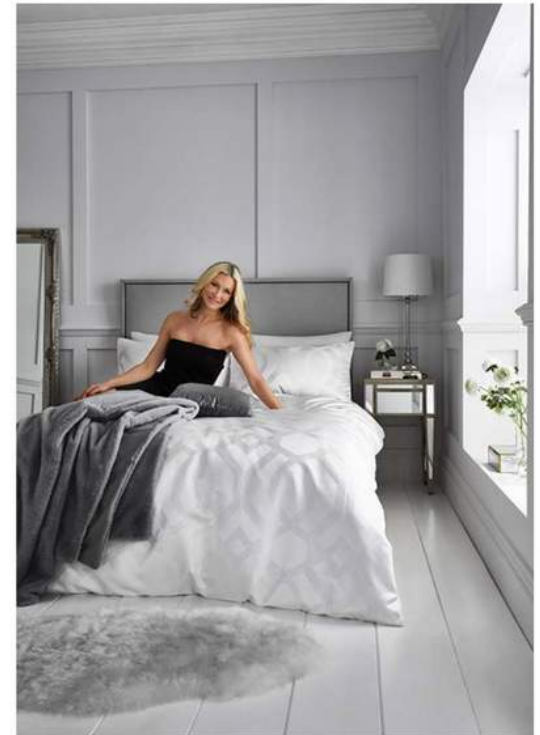
Caprice has launched her new By Caprice Home bedding collection