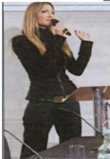
INSPIRING: Caprice Bourret urged listeners to be daring.