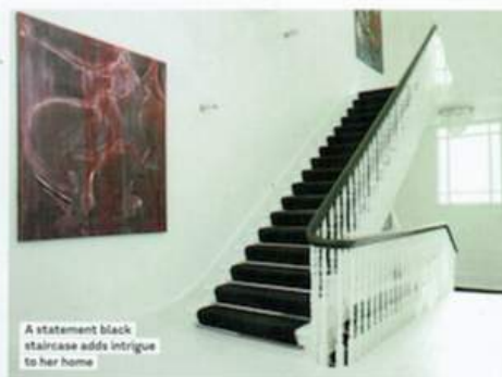
A statement black staircase adds intrigue to her home