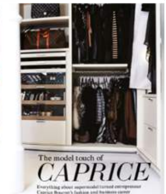
The model touch of CAPRICE Everything about supermodel turned entrepreneur Caprice Bourret's fashion and fitness career