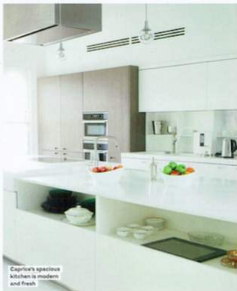
Caprice's spacious kitchen is modern and fresh

The new bed set with the ruffles is something a little different. We always like to try something new to see how our customers like it, but I think we're on to a winner there. It's very feminine, it's very glamorous and looks very high end. And of course, white is always a favourite. The soft greys always used to be my bestsellers, but now it's gone back to plain white.