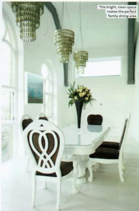
This bright, clean space makes the perfect family dining area

We then added key pieces for a little drama – I mean, I have a swing in the middle of my living room! That's a serious statement piece!