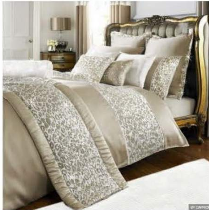
The entrepreneur has also designed her own bedding range By Caprice Home

The businesswoman - who became one of the most photographed women in the world during the 90s - is the face of the new collection just in time for Valentine's Day.