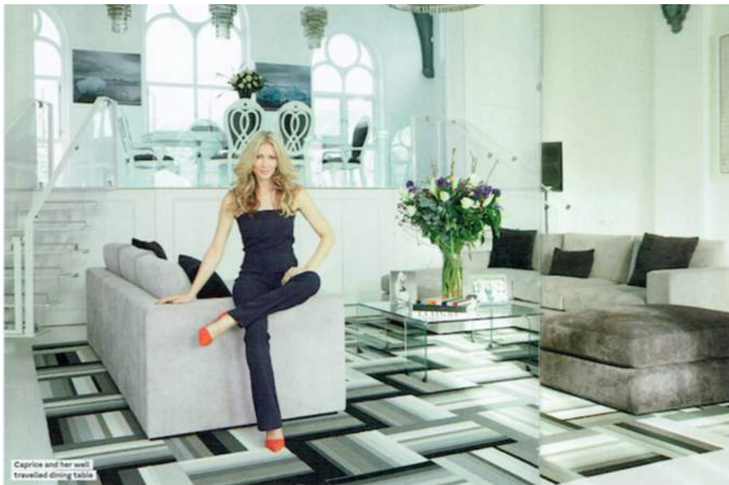
Caprice and her well-travelled dining table