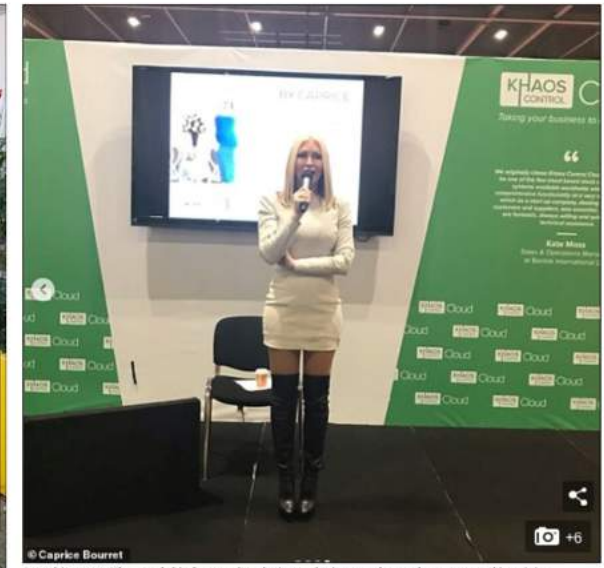
© Caprice Bourret Speaking out: The model is focused on being a doting mother to her sons and is raising awareness for charity Brain Tumour Research