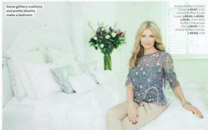
Some glittery cushions and pretty blooms make a bedroom

Amore Ruffles Cushion Cover: LAKAF, £13; Amore Ruffles Duvet Cover: LKAG, LKAK, LKAL, from £19; Ruffles Pillowcase Pair: LKAP, £13; Amore Ruffles Runner: LKAG, £49