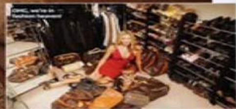
Love, her name isn't made up!