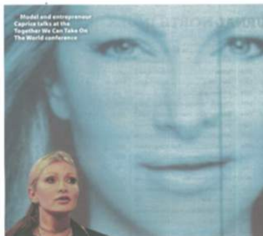
Model and entrepreneur Caprice talks at the Together We Can Take On The World conference

weren't anywhere near as commonplace as they are now, and, with the popularity of lads' magazines, Bourret saw an opportunity to put her name to a lingerie range.