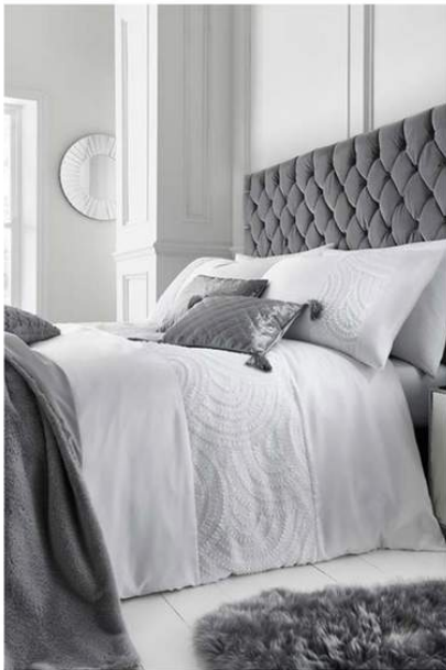
The collection is available at Next and Apple Tree Living