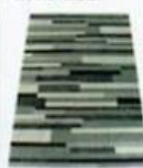
Blocks Rug #KYEQ, from £25

"We imported these carpet tiles from the US. I like the simple, elegant design, and tiles are so practical in a busy household as when you have kids, some spillages are inevitable!"