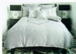
Viggo Mirrored One-Drawer Bedside Cabinet: T3CA4, £89

"To match the hues in my home, the By Caprice Home Krystle collection is ideal. It's very elegant and I love the delicate heart embroidery."