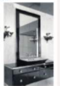
The bed in Caprice's new home

The Harold & Bertram is a classic bed range with a range of beds and a range of beds. Bedroom.com