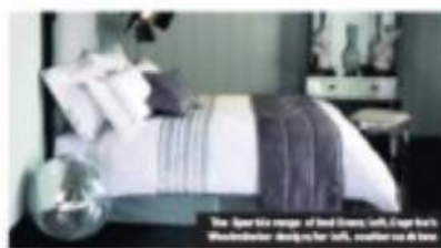
The bed in Caprice's new home