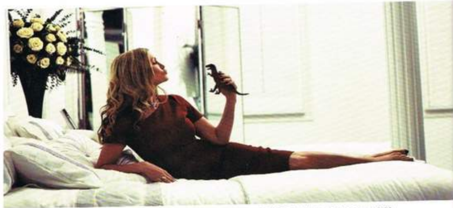
Caprice wears (incl cover): Burgundy Victoria Beckham dress £1550 • Black JBrand mid-rise jeans £180 Light Blue long sleeved shirt by 2nd Day £140 • Black wet-look AG jeans £220